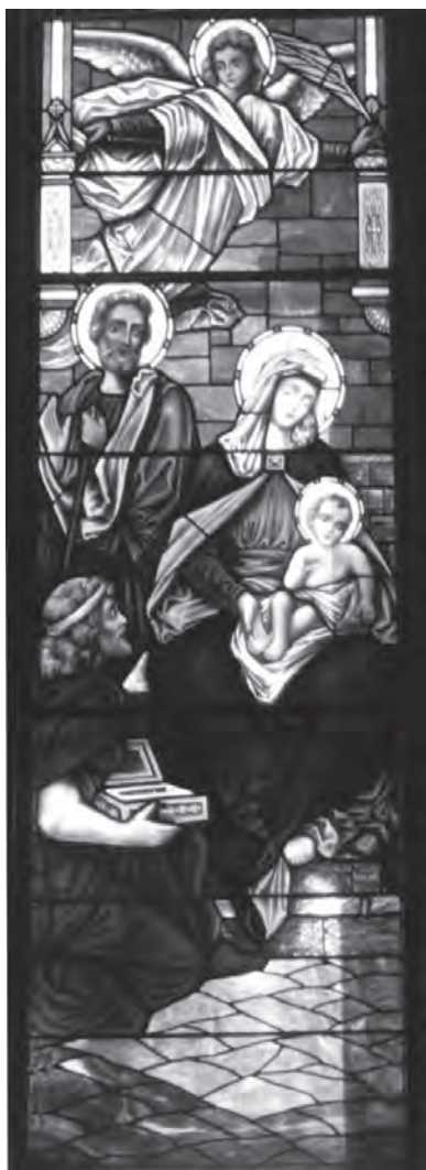
From St. Anthony's Stained Glass Nativity Window